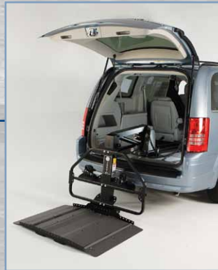
JOEY™ INTERIOR PLATFORM LIFT VSL-4000HW