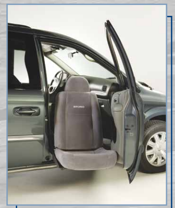
TURNY™ ORBIT® SEAT

1780 Executive Drive, P.O. Box 84, Oconomowoc, WI 53066 www.bruno.com