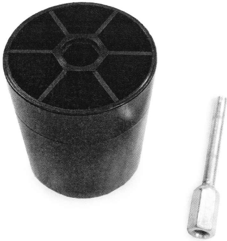
3" leg extenders with bolt.