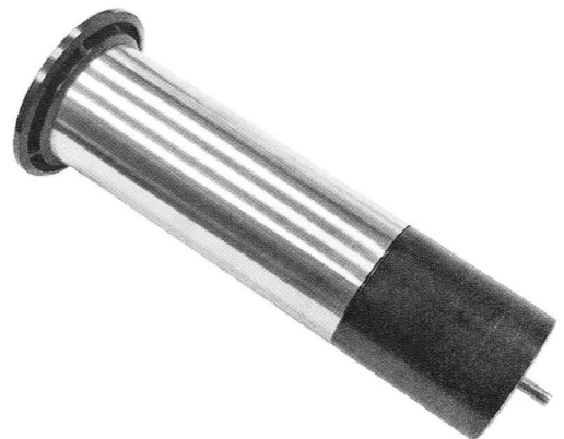
Slide plastic extender onto bolt and reattach leg to bed.