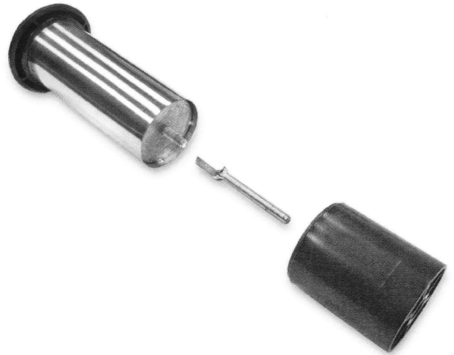
Remove existing leg from bed.